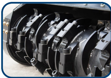
Four Position Anvil Tooth