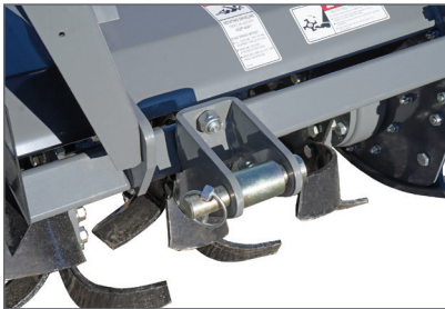
ADJUSTABLE HITCH FOR CATEGORY 1 AND CATEGORY 2