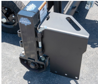
Reversible side shield

This Heavy Duty Series 2 Power Rake follows close on the heels of our previously released Severe Duty model. This lighter unit is suited to smaller frame skid steers and walk behind machines. The bolt-on mount allows greater flexibility for rental companies and dealers to have the correct model for the right machine, with mounts offered for mini and full size skid steer machines.