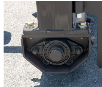
Heavy duty protected bearing