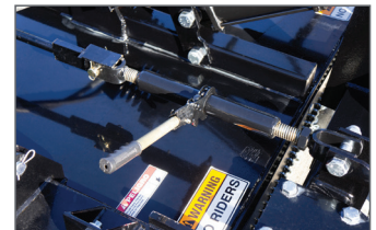
RACHET LEVEL ADJUSTMENT