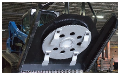
500 LB BLADE CARRIER