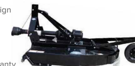
Part No. 403110, 403115 and 403120