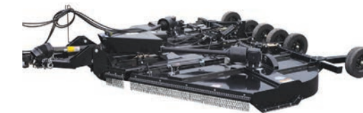
Part No. 12'-403150 and 15'-403155