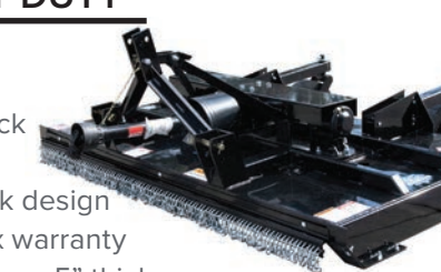
Part No. 403125 and 403127