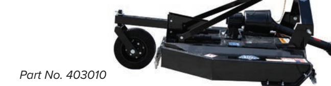
Part No. 403010