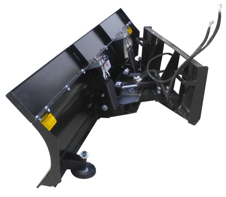
Shown with optional height extension