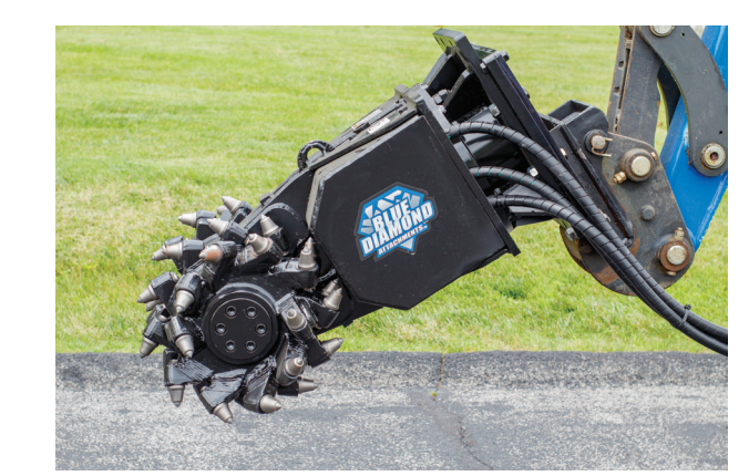
Shown on excavator; skid steer mount available.

The Blue Diamond® Rock & Concrete Grinders are a must have tool for any application where rock, concrete, and asphalt need to be removed. They allow for a clean trench to be made with vertical walls. Six different models are available, and mounts to fit most excavators and skid steers.