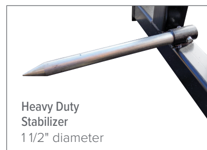
Heavy Duty Stabilizer 1 1/2" diameter