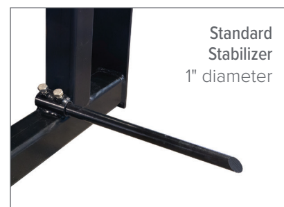
Standard Stabilizer 1" diameter