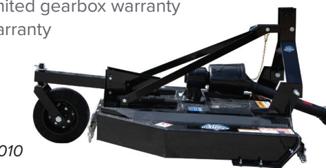
Part No. 403010