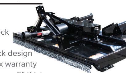
Part No. 403125 and 403127