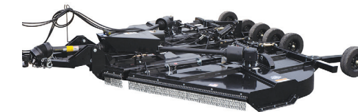
Part No. 12'-403150 and 15'-403155