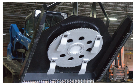
500 LB BLADE CARRIER