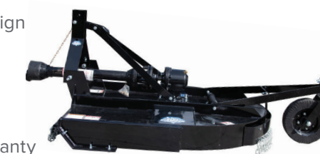
Part No. 403110, 403115 and 403120